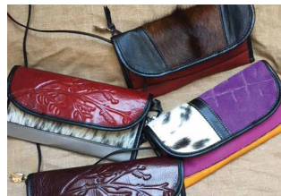
Grab & Go Purse